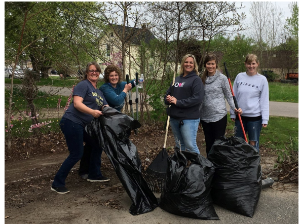
Pullman "Day of Caring" volunteers cleaning up in May

Applications will be accepted for Back to School backpacks starting July 8 at the office on 56th St. Any questions, call 269-236-6295 or email ann@loveincnwa.org .